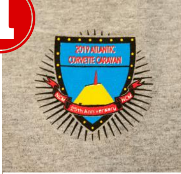
(Front of Shirt Design)